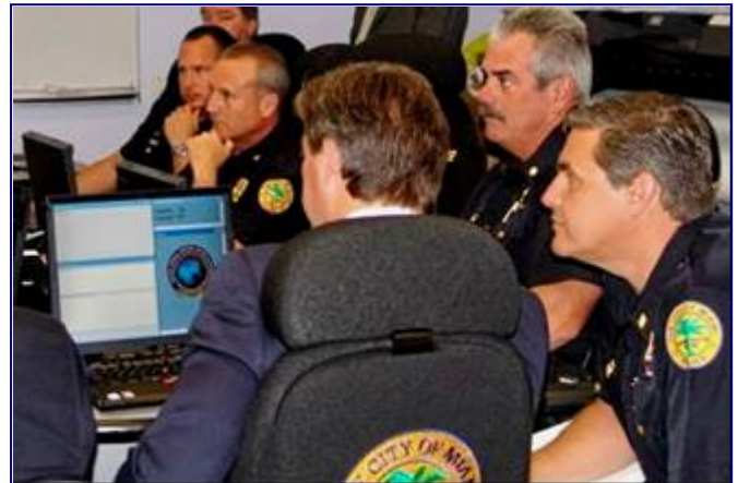
Police officers receiving training via a Crisis Simulations International simulation

*Crisis Simulation's ActiveShooter™ simulation follows US Department of Homeland Security HSEEP guidelines.