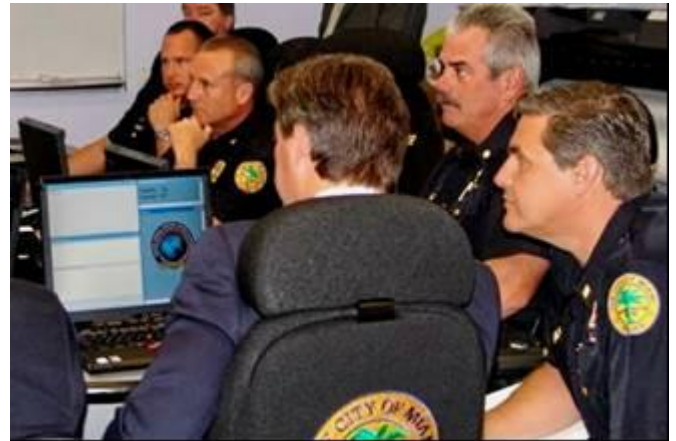
Police officers receiving training via a Crisis Simulations International simulation

Crisis Simulation International developed the Active Shooter simulation for the Portland Police Bureau, following accepted protocols and PPB directives, to complement training for its supervisors.